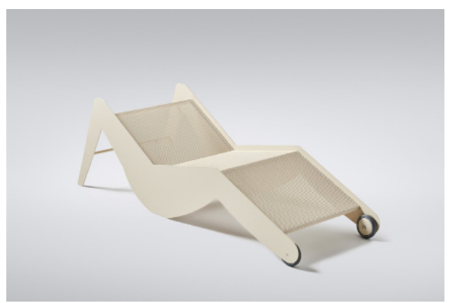
MATERIALS - Aluminium Frame - Reticulated Foam - Fabric